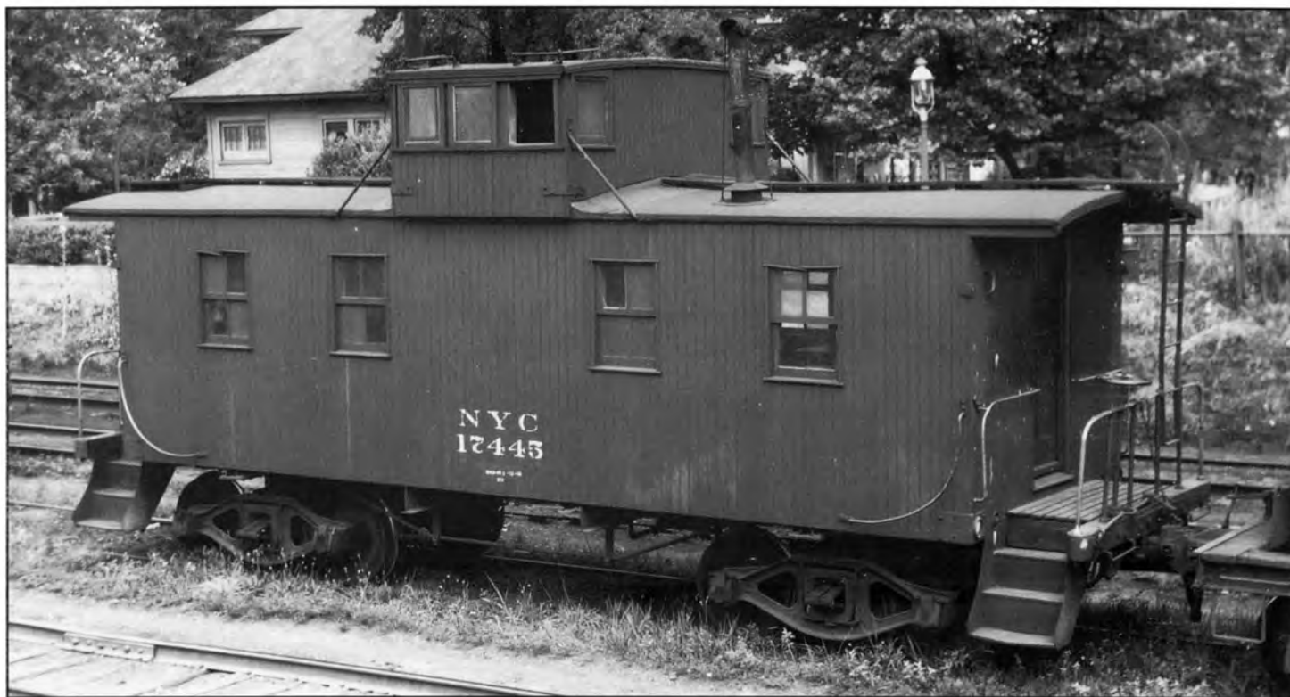
NYC 17445 at Springfield, Ohio, July 9, 1946.