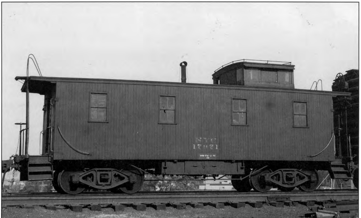
NYC 17971, Squaw Island, Buffalo, New York, October 26, 1952.