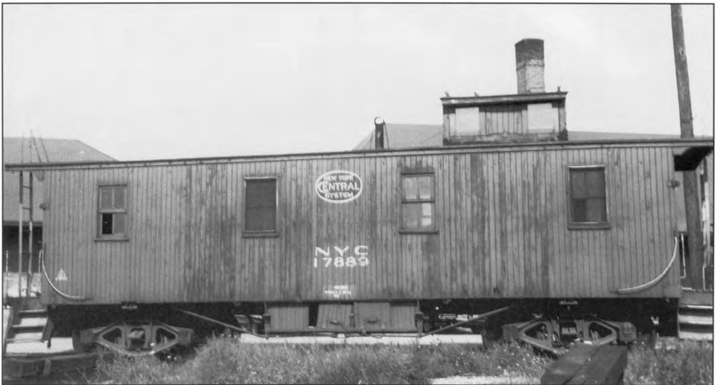
NYC 17889, Saginaw, Michigan, August 30, 1965.