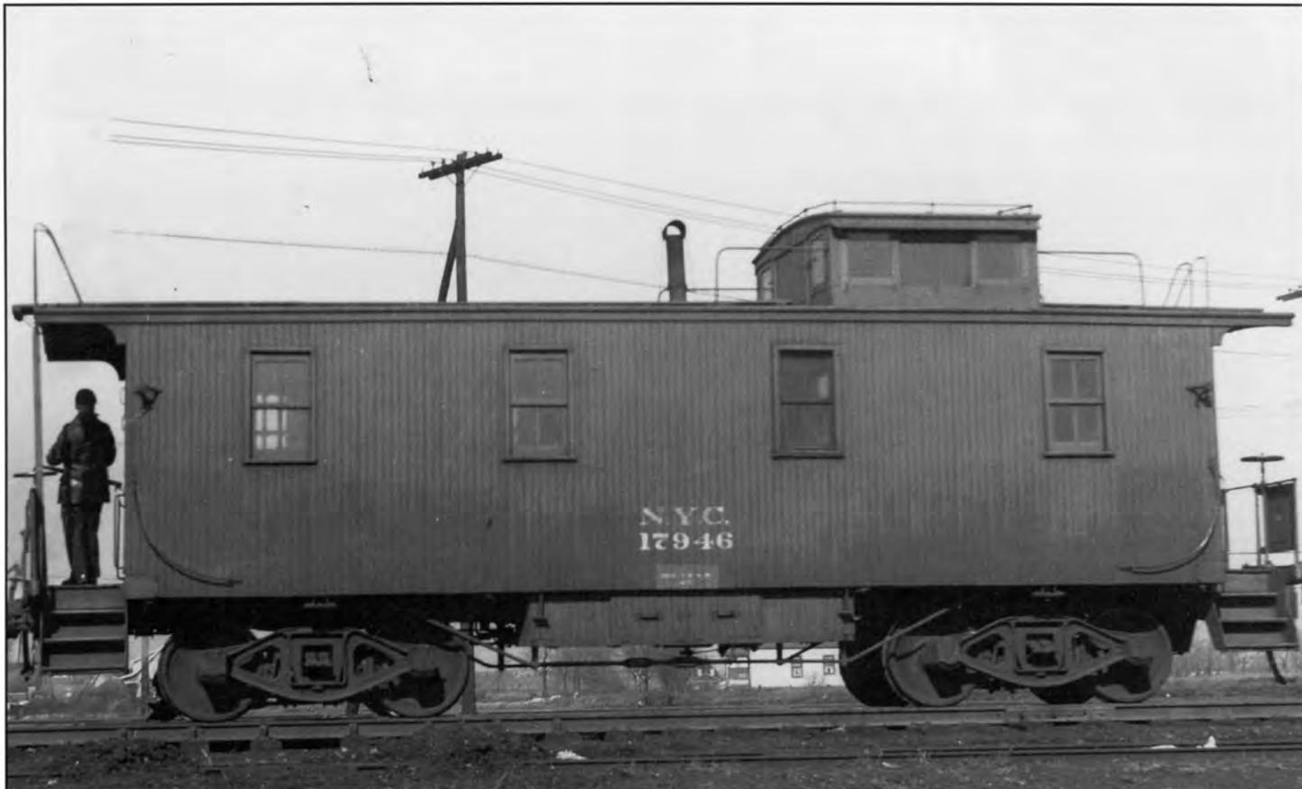
NYC 17946, Suspension Bridge, New York, February 12, 1939.