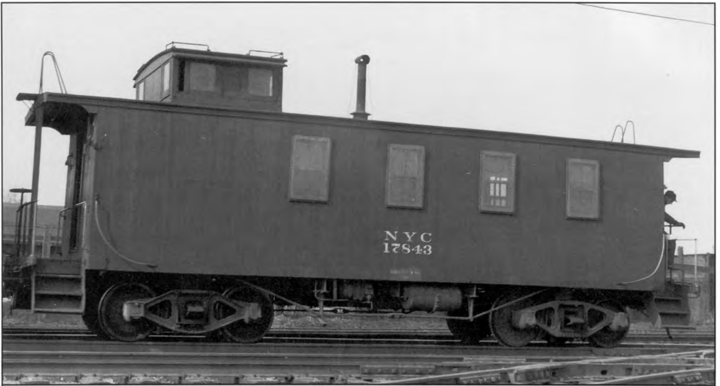
NYC 17843, Delray, Michigan, March 13, 1955.