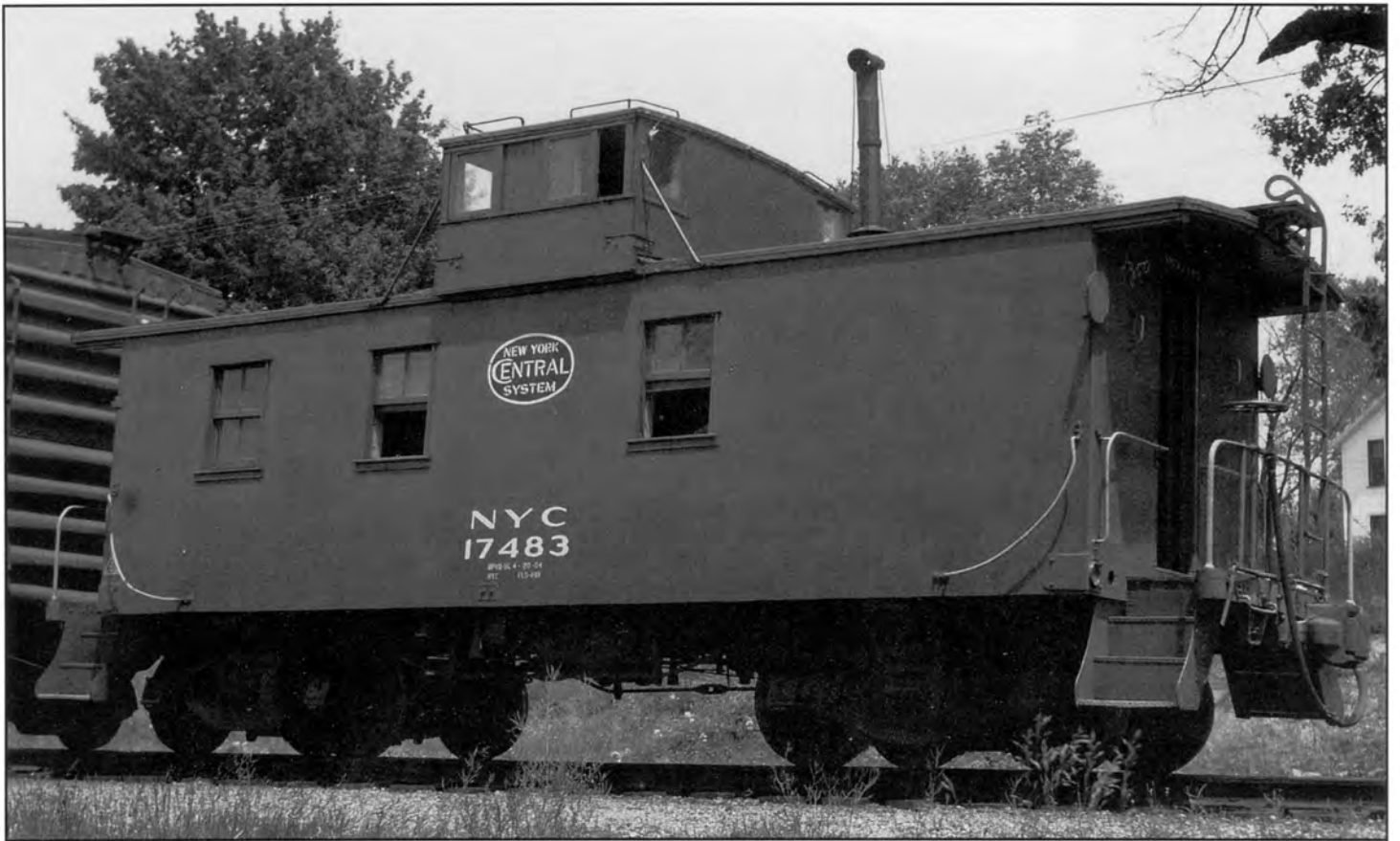
NYC 17483 at Constantine, Michigan, July, 1964. Rebuilt at Beech Grove April 29, 1964 with plywood siding.