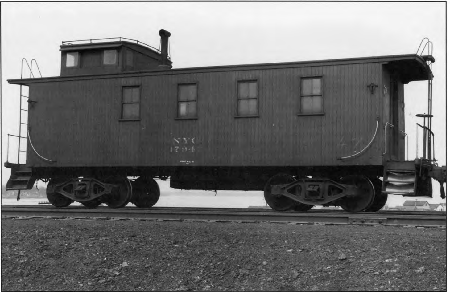
NYC 17947, Squaw Island, Buffalo, New York, March 30, 1952.