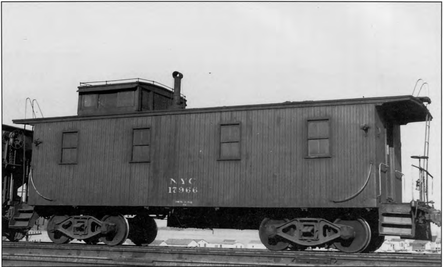
NYC 17966, Squaw Island, Buffalo, New York, October 26, 1952.