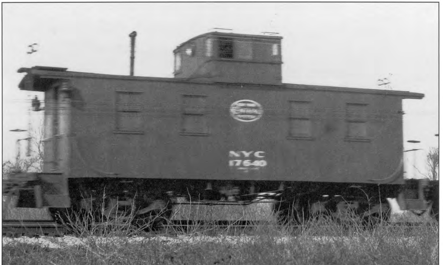
NYC 17640, near Anderson, Indiana, November 12, 1957.