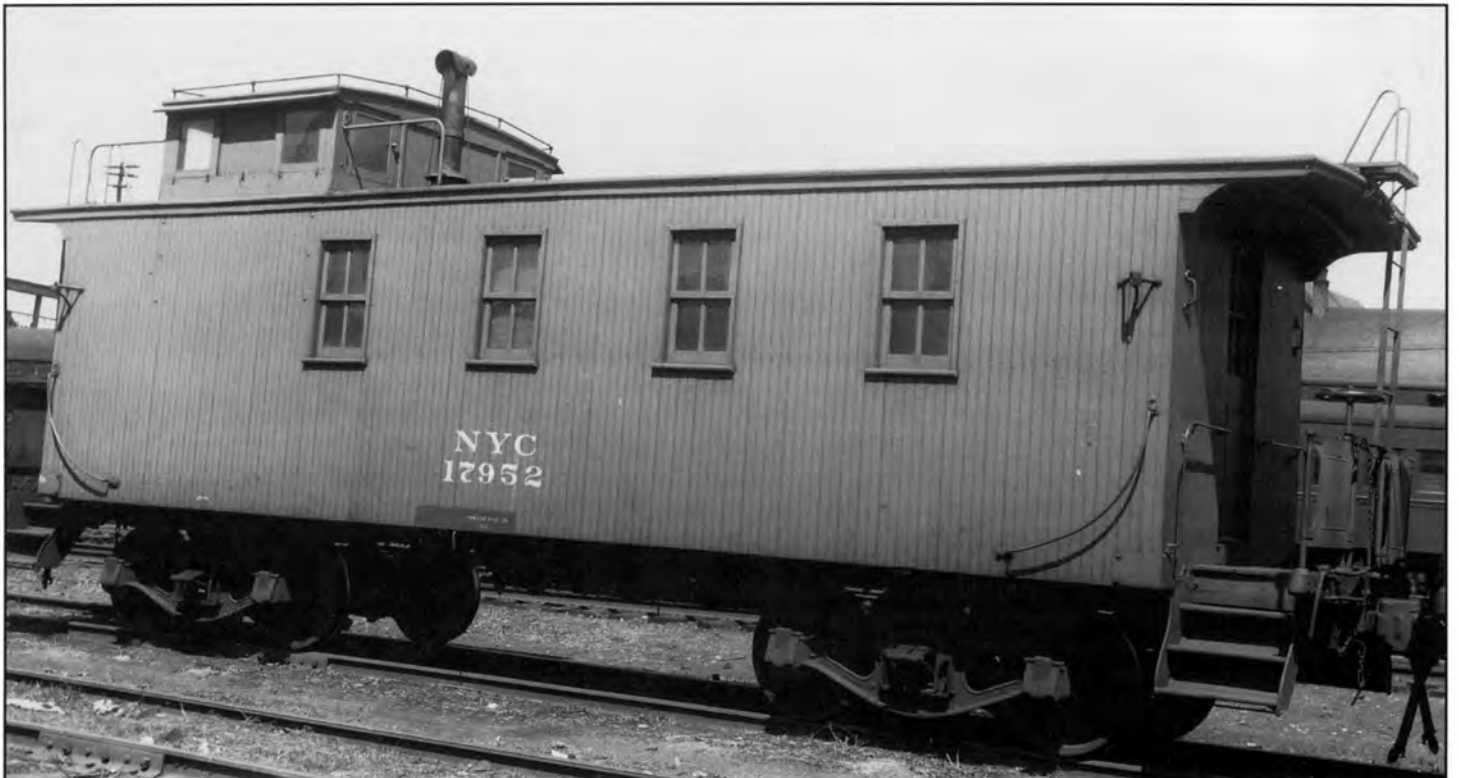
NYC 17952, Suspension Bridge, New York, April 29, 1939.