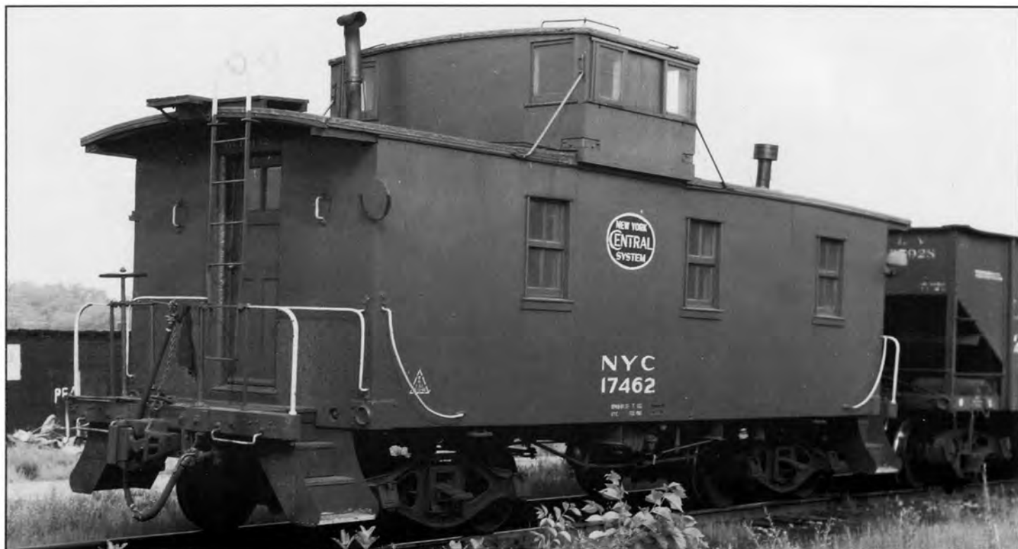
NYC 17462 at Amsterdam, New York, June 15, 1967.